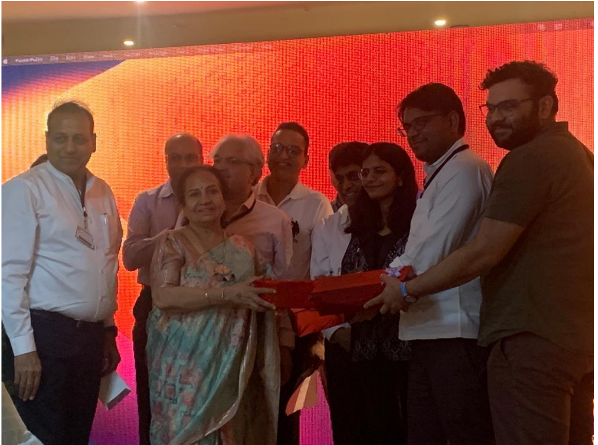
(Awardees of Dr. Saadgi Jagawat Memorial Quiz-2023)