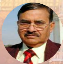
Dr. Ashok Singhal